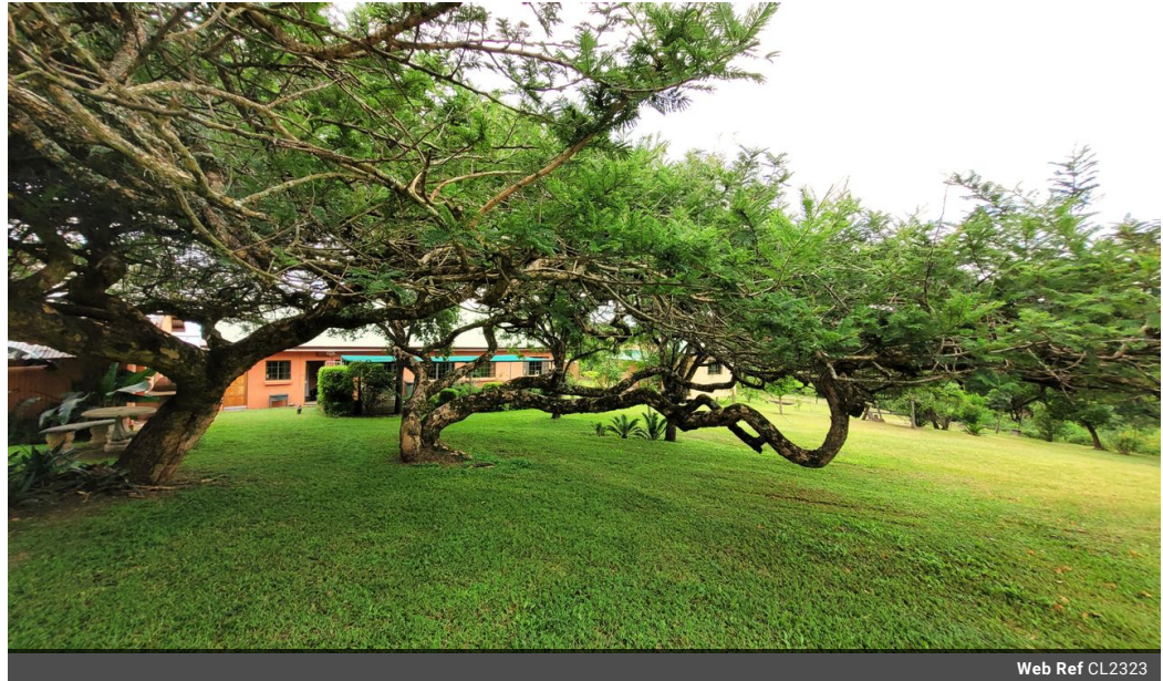
Web Ref CL2323

The Crossing Shopping Centre, Shop 78, Off R40, Nelspruit, Mpumalanga 1200