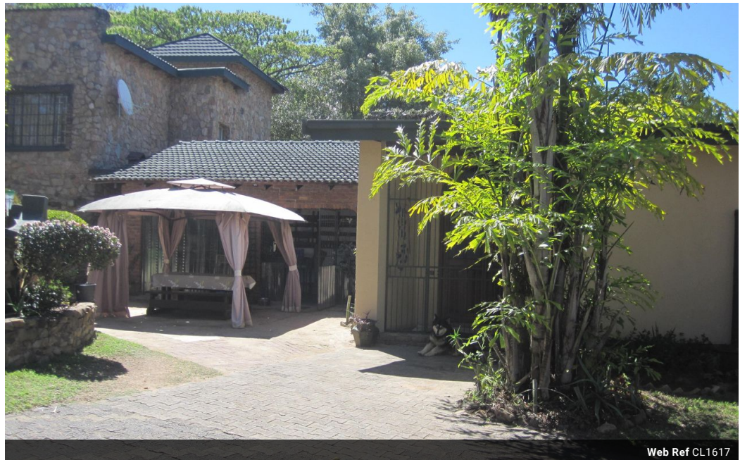
Web Ref CL1617

The Crossing Shopping Centre, Shop 78, Off R40, Nelspruit, Mpumalanga 1200