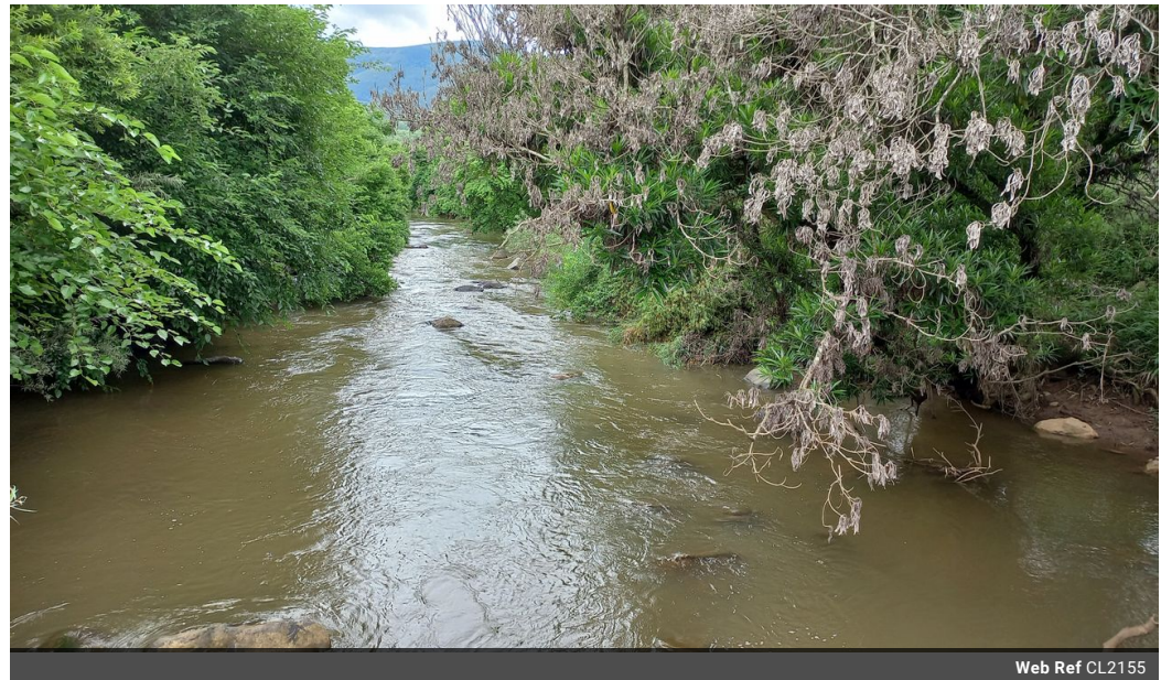
Web Ref CL2155

The Crossing Shopping Centre, Shop 78, Off R40, Nelspruit, Mpumalanga 1200