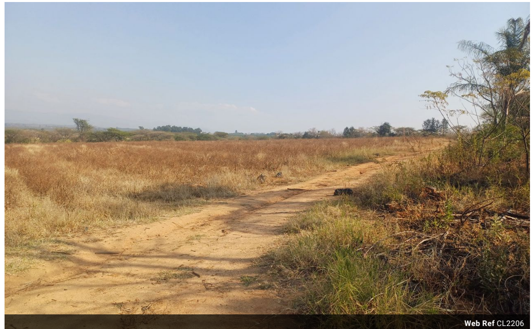
Web Ref CL2206

The Crossing Shopping Centre, Shop 78, Off R40, Nelspruit, Mpumalanga 1200