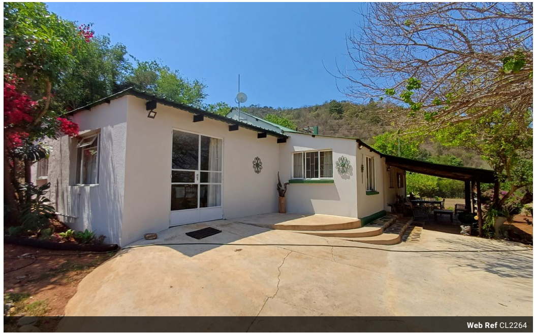
Web Ref CL2264

The Crossing Shopping Centre, Shop 78, Off R40, Nelspruit, Mpumalanga 1200