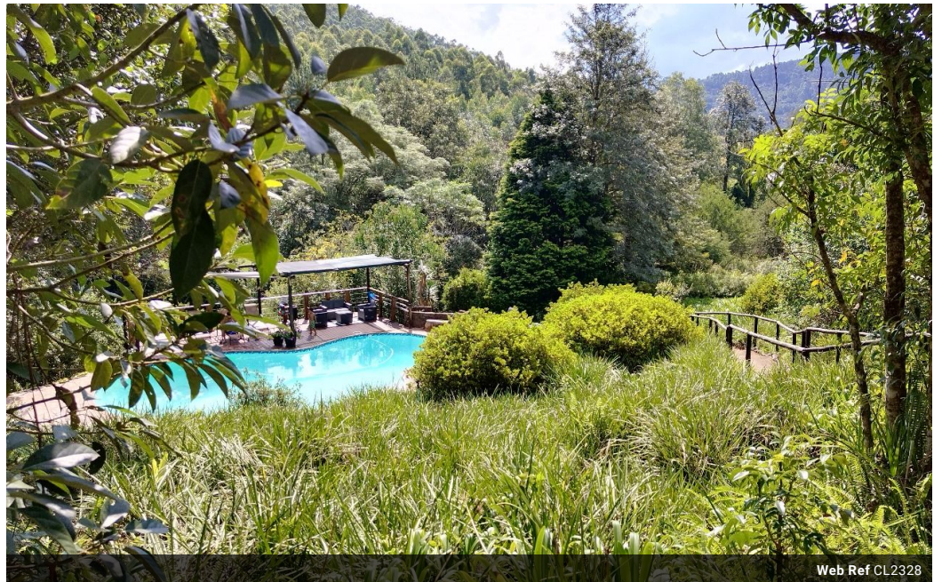
Web Ref CL2328

The Crossing Shopping Centre, Shop 78, Off R40, Nelspruit, Mpumalanga 1200