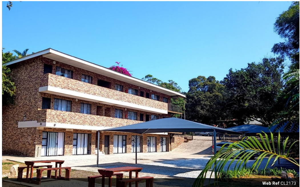
Web Ref CL2173

The Crossing Shopping Centre, Shop 78, Off R40, Nelspruit, Mpumalanga 1200