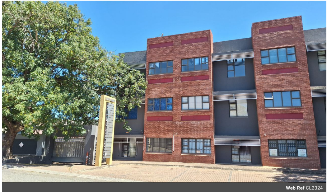
Web Ref CL2324

The Crossing Shopping Centre, Shop 78, Off R40, Nelspruit, Mpumalanga 1200