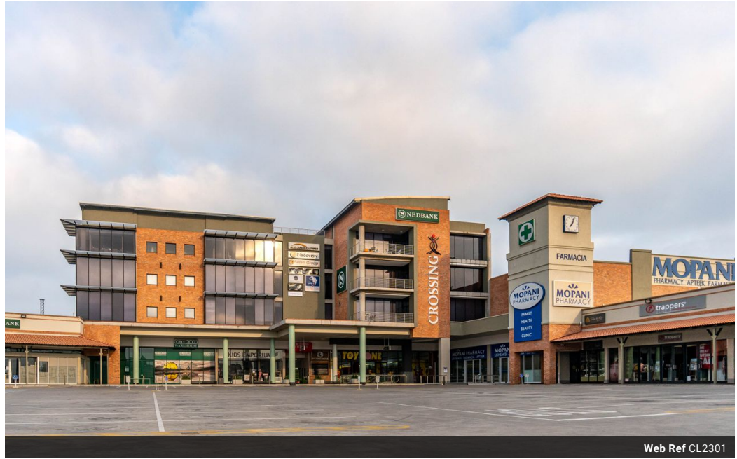
Web Ref CL2301

The Crossing Shopping Centre, Shop 78, Off R40, Nelspruit, Mpumalanga 1200