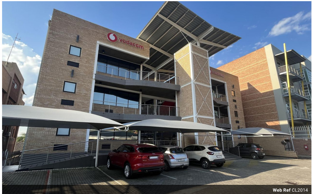
Web Ref CL2014

The Crossing Shopping Centre, Shop 78, Off R40, Nelspruit, Mpumalanga 1200