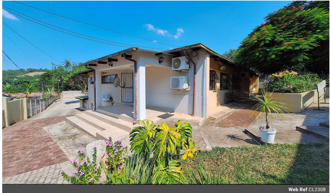
Web Ref CL2308

The Crossing Shopping Centre, Shop 78, Off R40, Nelspruit, Mpumalanga 1200