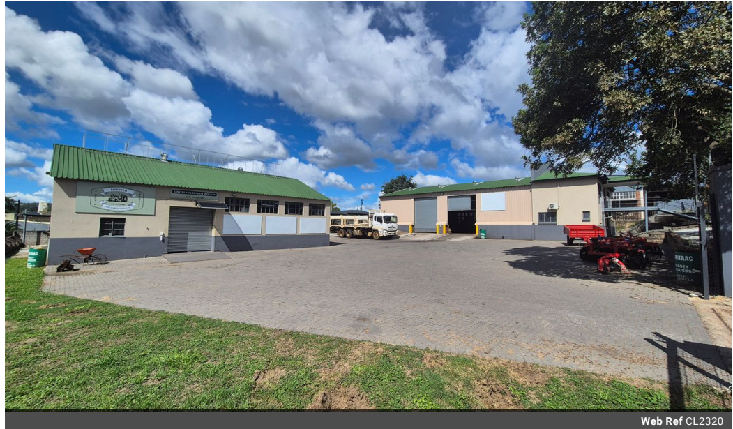
Web Ref CL2320

The Crossing Shopping Centre, Shop 78, Off R40, Nelspruit, Mpumalanga 1200