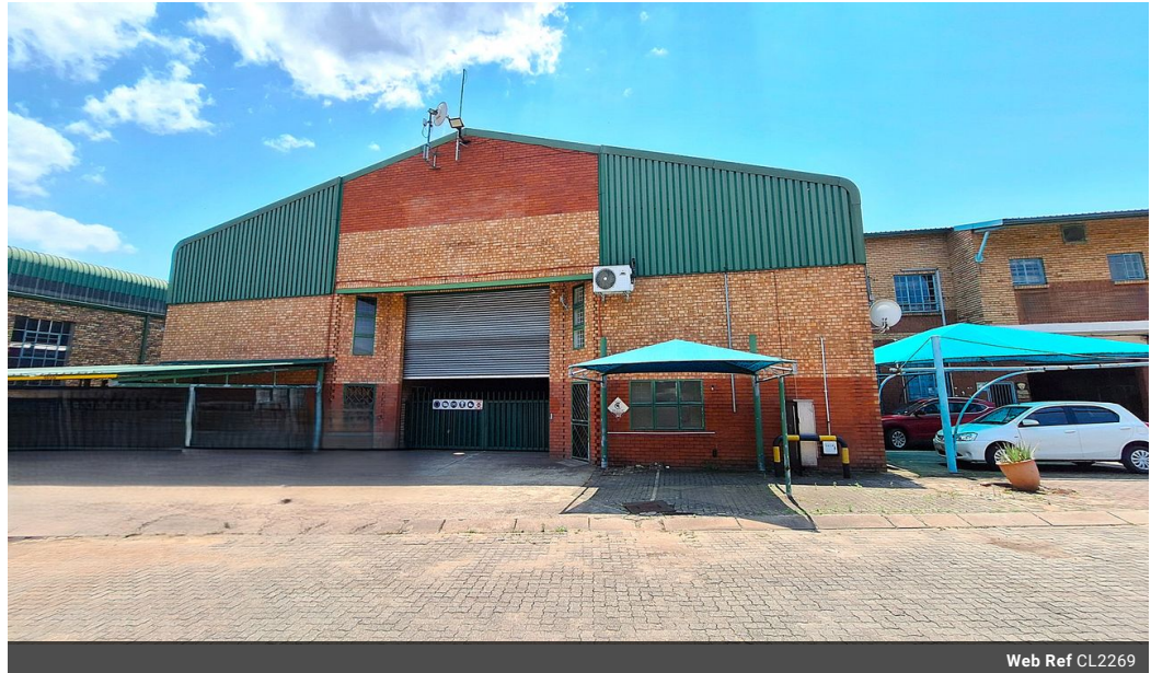
Web Ref CL2269

The Crossing Shopping Centre, Shop 78, Off R40, Nelspruit, Mpumalanga 1200