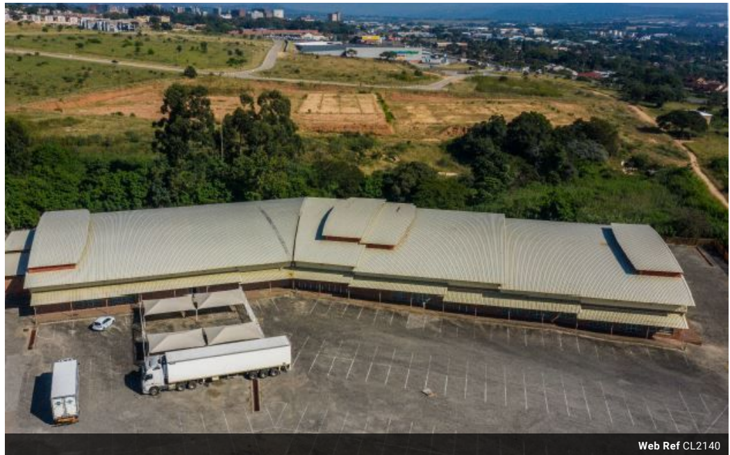
Web Ref CL2140

The Crossing Shopping Centre, Shop 78, Off R40, Nelspruit, Mpumalanga 1200