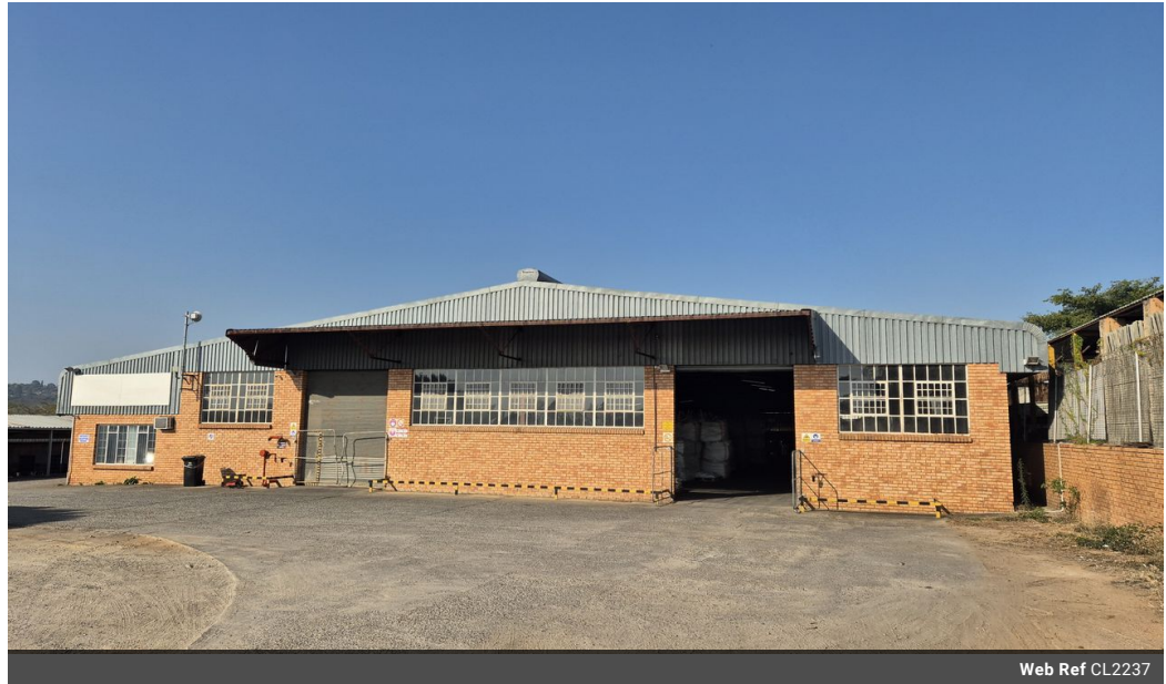
Web Ref CL2237

The Crossing Shopping Centre, Shop 78, Off R40, Nelspruit, Mpumalanga 1200