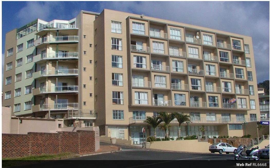
Web Ref RL6668

The Crossing Shopping Centre, Shop 78, Off R40, Nelspruit, Mpumalanga 1200