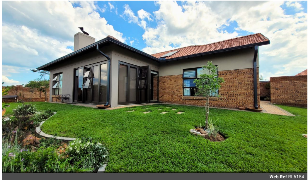
Web Ref RL6154

The Crossing Shopping Centre, Shop 78, Off R40, Nelspruit, Mpumalanga 1200