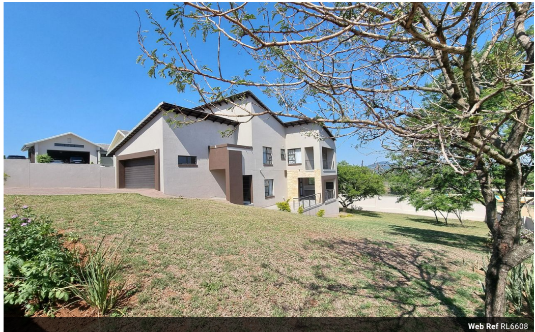
Web Ref RL6608

The Crossing Shopping Centre, Shop 78, Off R40, Nelspruit, Mpumalanga 1200