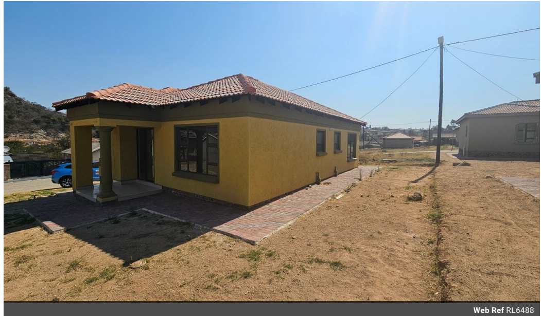
Web Ref RL6488

The Crossing Shopping Centre, Shop 78, Off R40, Nelspruit, Mpumalanga 1200