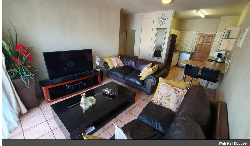
Web Ref RL6599

The Crossing Shopping Centre, Shop 78, Off R40, Nelspruit, Mpumalanga 1200