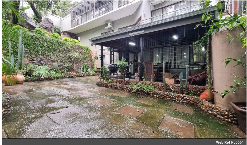
Web Ref RL6661

The Crossing Shopping Centre, Shop 78, Off R40, Nelspruit, Mpumalanga 1200