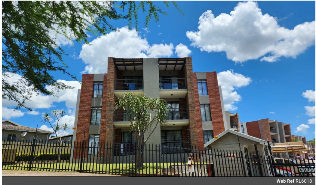
Web Ref RL6018

The Crossing Shopping Centre, Shop 78, Off R40, Nelspruit, Mpumalanga 1200