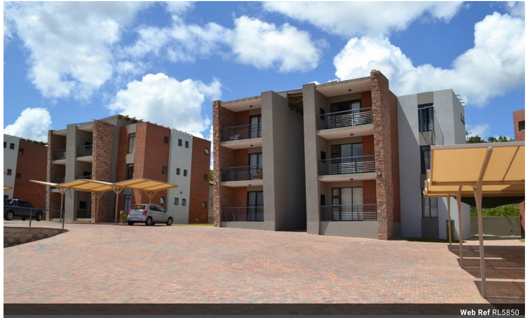
Web Ref RL5850

The Crossing Shopping Centre, Shop 78, Off R40, Nelspruit, Mpumalanga 1200