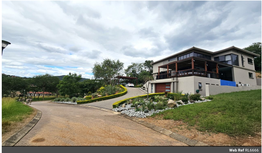
Web Ref RL6666

The Crossing Shopping Centre, Shop 78, Off R40, Nelspruit, Mpumalanga 1200