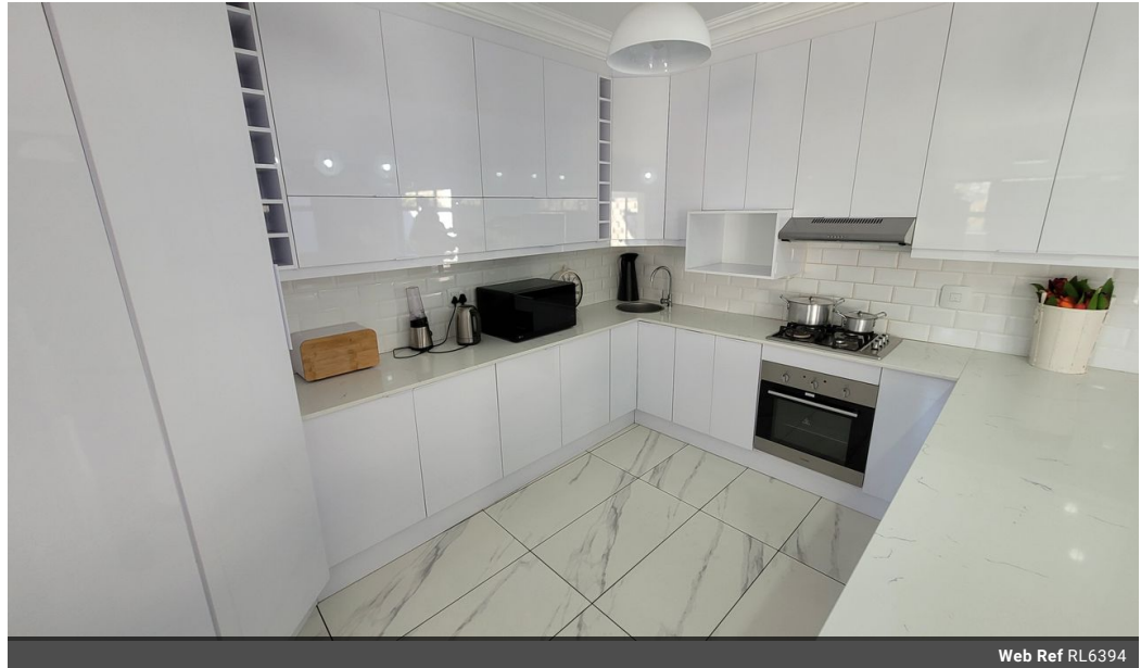
Web Ref RL6394

The Crossing Shopping Centre, Shop 78, Off R40, Nelspruit, Mpumalanga 1200