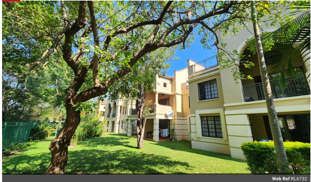
Web Ref RL6732