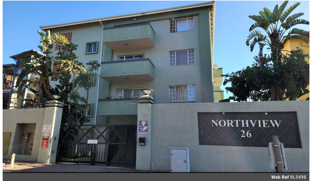
Web Ref RL5498

The Crossing Shopping Centre, Shop 78, Off R40, Nelspruit, Mpumalanga 1200