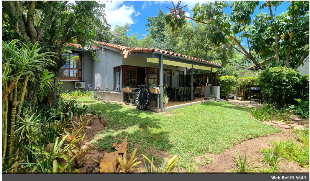
Web Ref RL6649

The Crossing Shopping Centre, Shop 78, Off R40, Nelspruit, Mpumalanga 1200