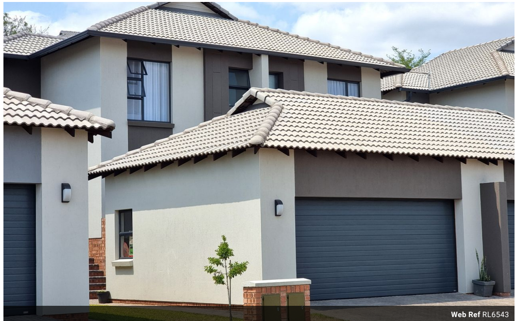
Web Ref RL6543

The Crossing Shopping Centre, Shop 78, Off R40, Nelspruit, Mpumalanga 1200