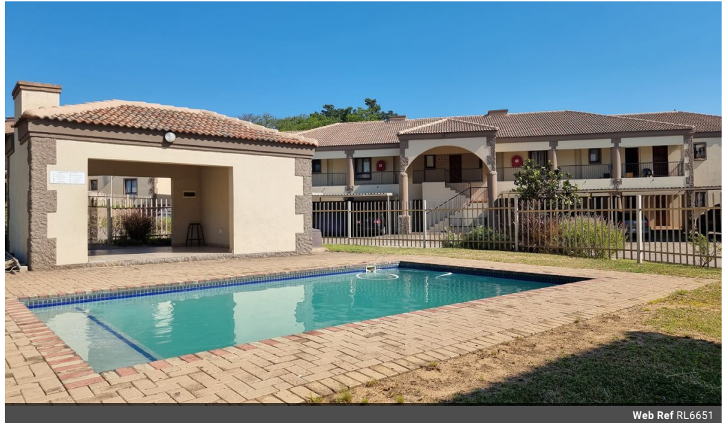
Web Ref RL6651

The Crossing Shopping Centre, Shop 78, Off R40, Nelspruit, Mpumalanga 1200