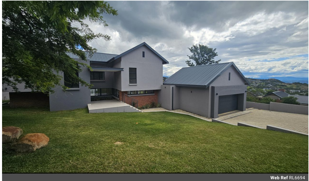
Web Ref RL6694

The Crossing Shopping Centre, Shop 78, Off R40, Nelspruit, Mpumalanga 1200