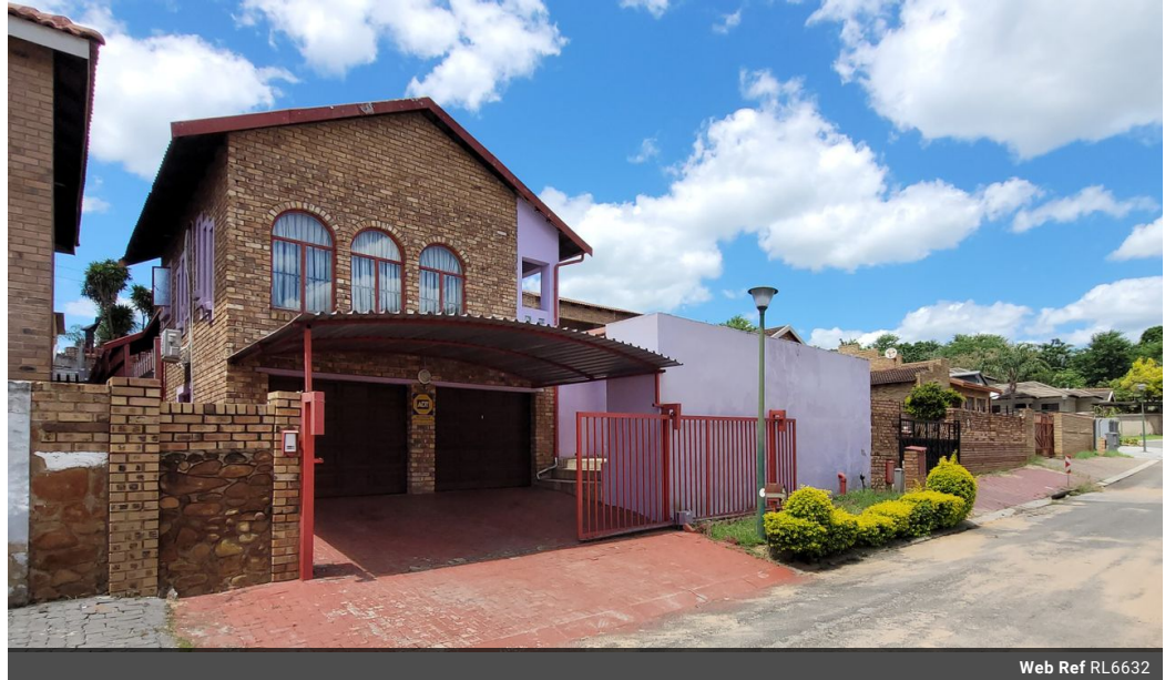
Web Ref RL6632

The Crossing Shopping Centre, Shop 78, Off R40, Nelspruit, Mpumalanga 1200