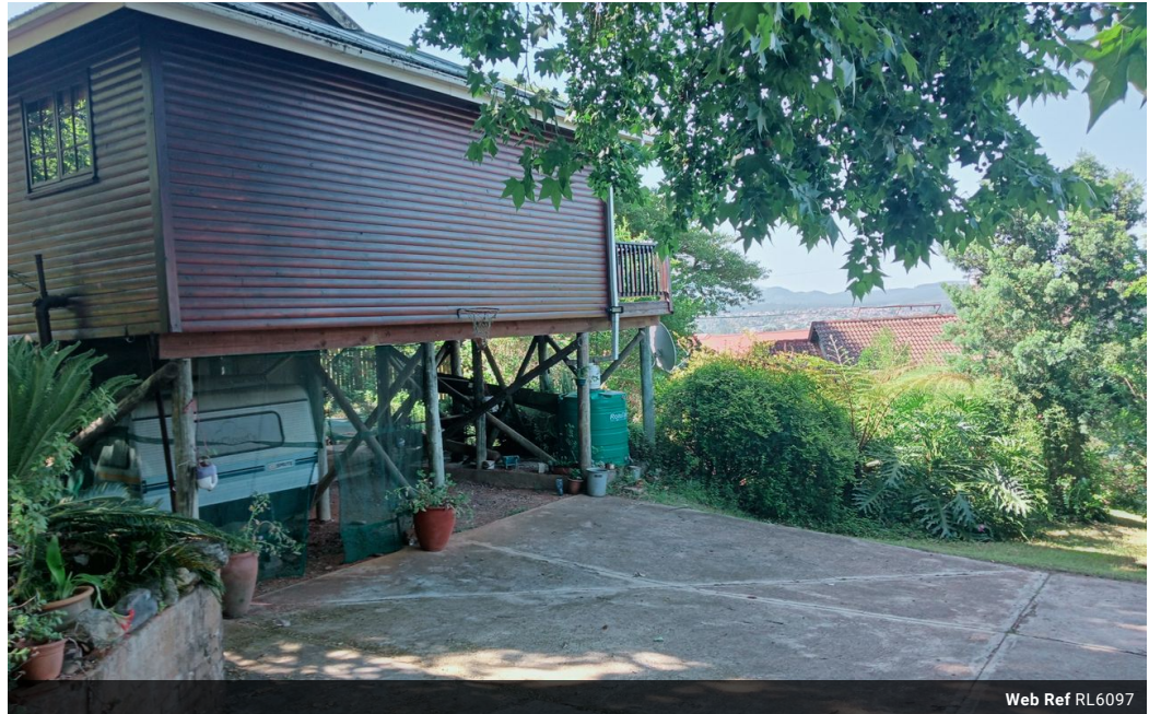
Web Ref RL6097

The Crossing Shopping Centre, Shop 78, Off R40, Nelspruit, Mpumalanga 1200