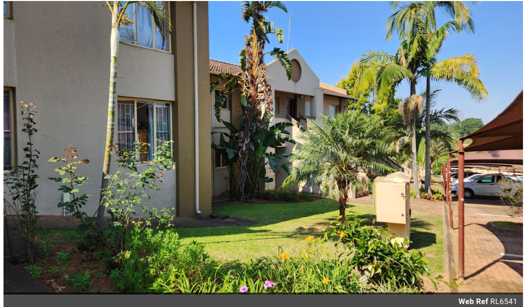
Web Ref RL6541

The Crossing Shopping Centre, Shop 78, Off R40, Nelspruit, Mpumalanga 1200