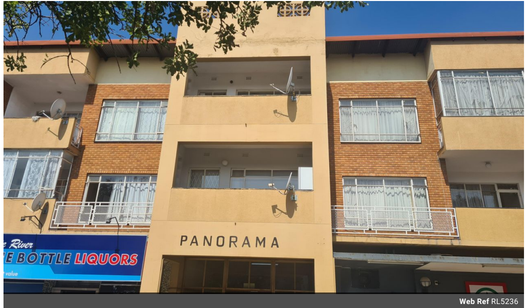
Web Ref RL5236

The Crossing Shopping Centre, Shop 78, Off R40, Nelspruit, Mpumalanga 1200