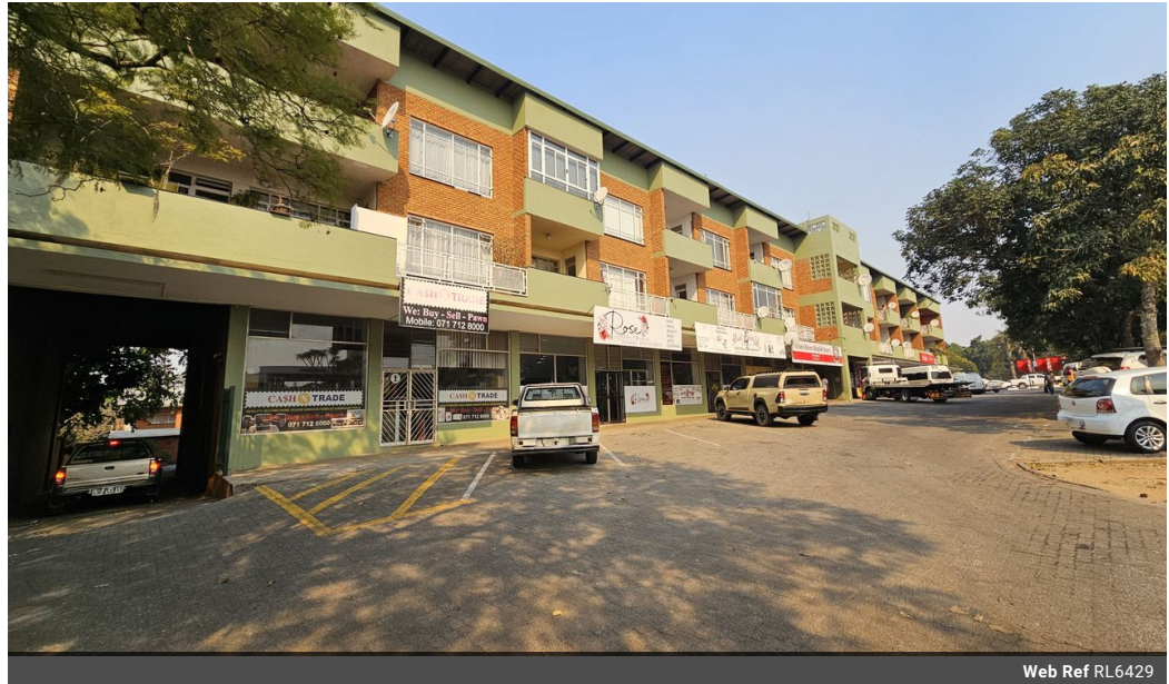
Web Ref RL6429

The Crossing Shopping Centre, Shop 78, Off R40, Nelspruit, Mpumalanga 1200