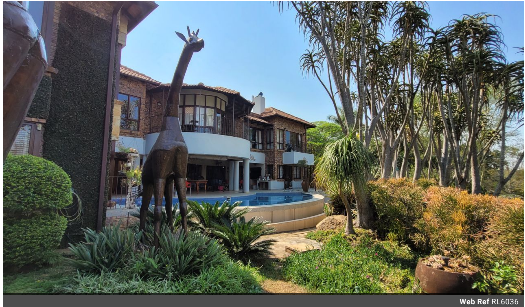
Web Ref RL6036

The Crossing Shopping Centre, Shop 78, Off R40, Nelspruit, Mpumalanga 1200