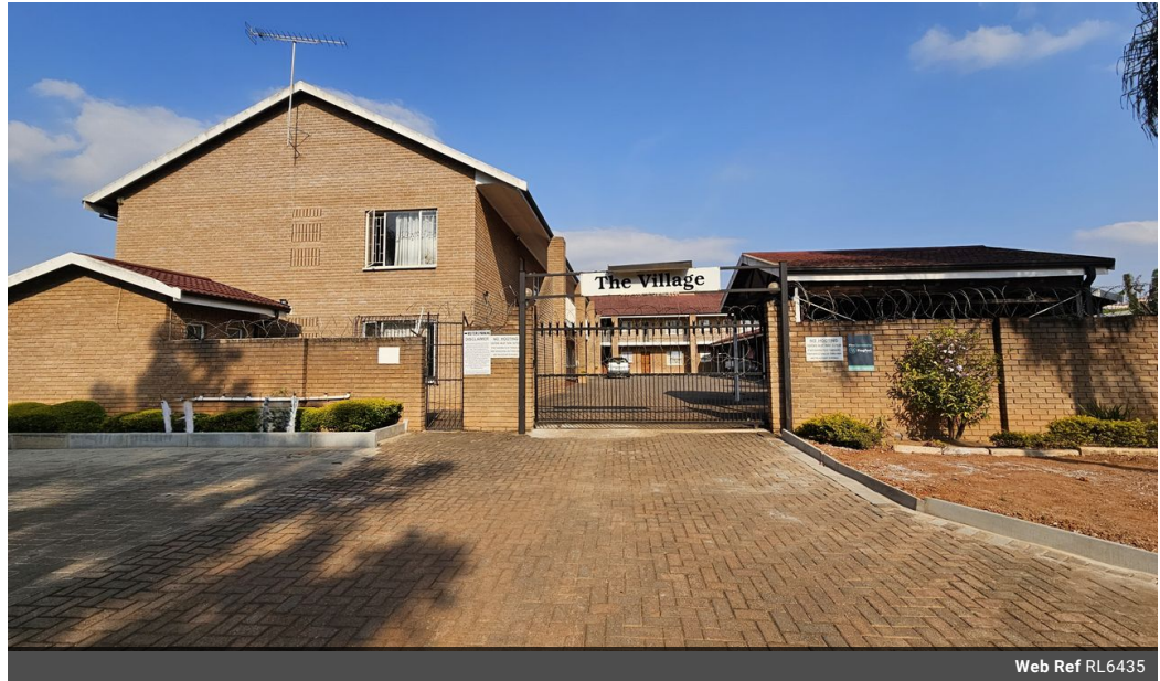
Web Ref RL6435

The Crossing Shopping Centre, Shop 78, Off R40, Nelspruit, Mpumalanga 1200