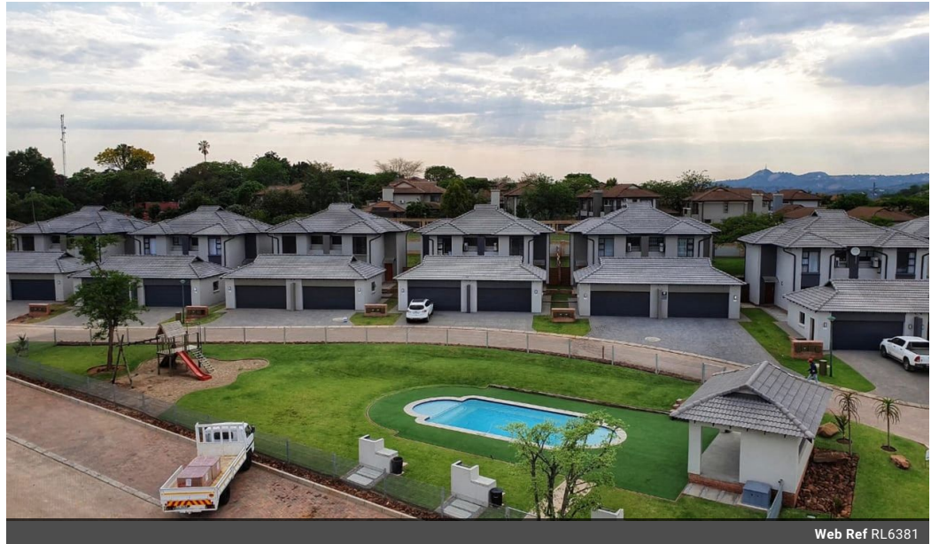
Web Ref RL6381

The Crossing Shopping Centre, Shop 78, Off R40, Nelspruit, Mpumalanga 1200