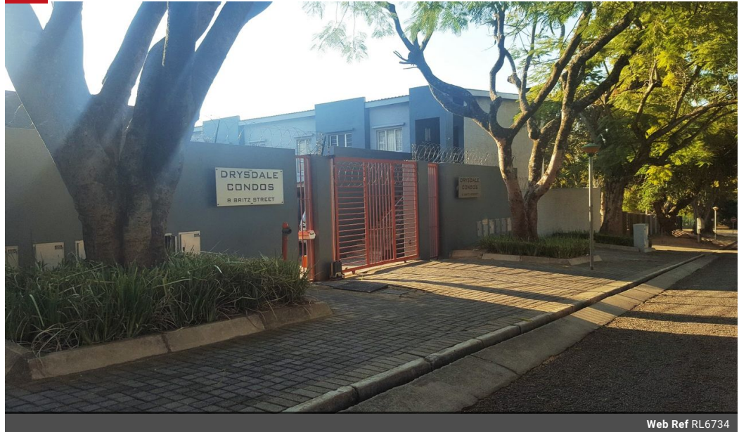
Web Ref RL6734