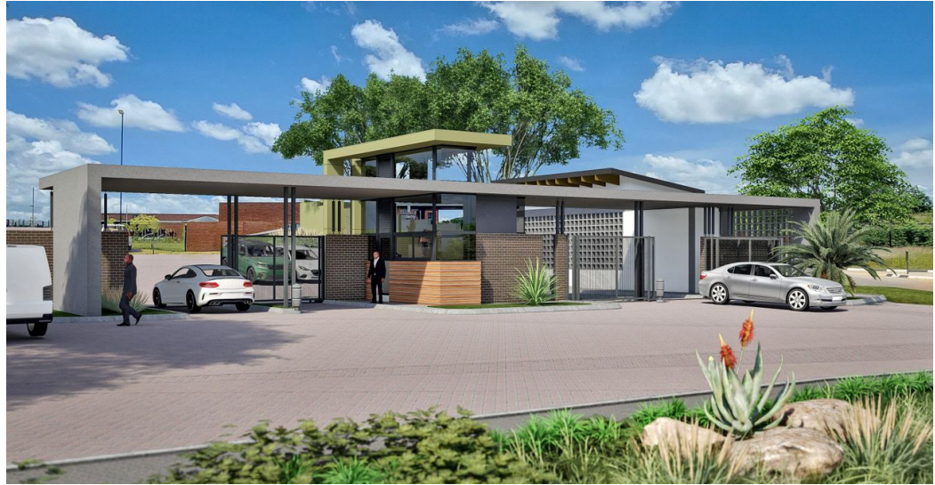
Web Ref RL5429

The Crossing Shopping Centre, Shop 78, Off R40, Nelspruit, Mpumalanga 1200